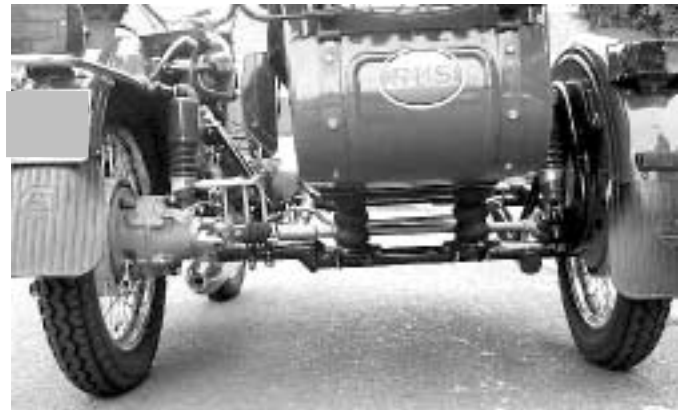
Ural sidecar drive system.