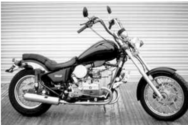
The Ural 750c Wolf, latest import into UK