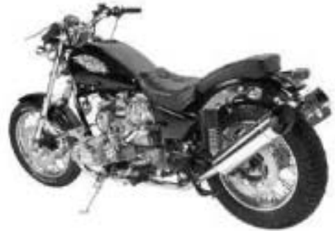
The Ural Volk with flatter 'bars