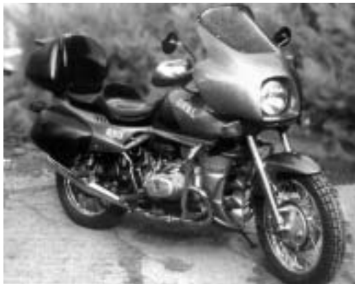
Ural factory Styling Exercise.

The Ural factory does sell its machines to the armed forces and security forces in many countries, including Egypt and allegedly the UN security forces in Kosovo. Various weapons are available, but not for civilian use!