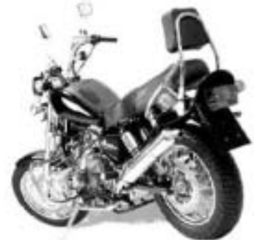
Ural 750cc Voyage

Attempts are being made by UralMoto to modernise their motorcycles. Much seems to be related to styling features. Sadly many western riders with the cash to buy leisure motorcycles prefer the traditional or retro styled machines, not machines that look to be a factory attempt at recreating a 1970s American chopper. We can only hope that the parts for the older machines will still be made available to keep the millions of older Urals on the road.