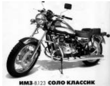
The Ural Solo Classic (650cc?)