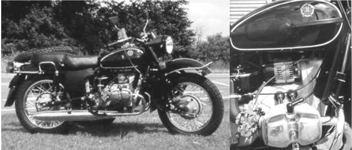
The latest year 2001 750cc Urals, many changes also to the transmission.