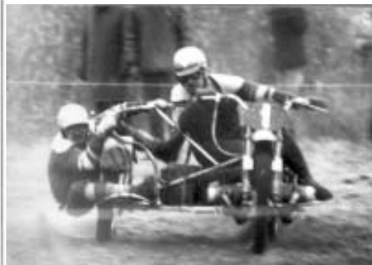
750cc Ural Moto Cross Outfit.