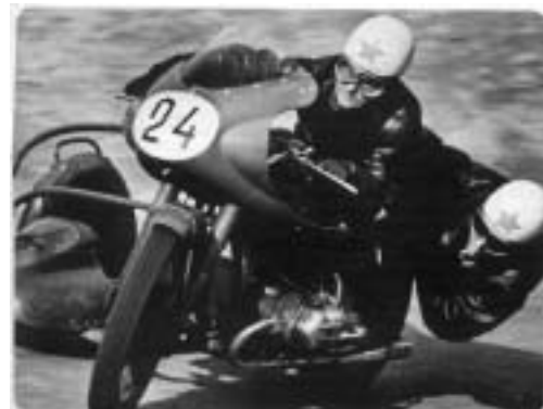
A Pair of road racing Ural outfits. The one on the right is a M77.