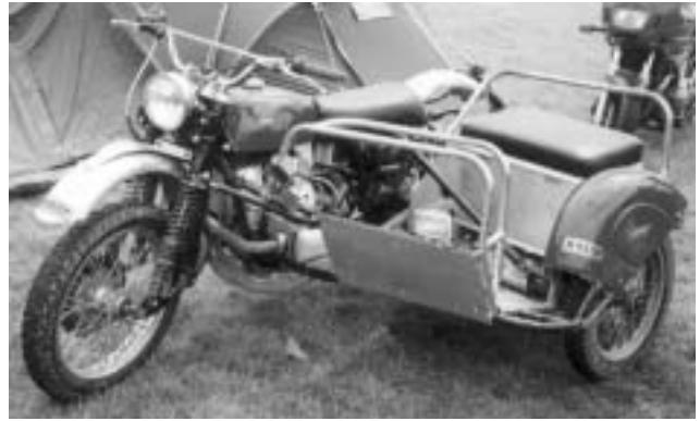
British registered Dnieper Moto Cross outfit with 'Wasp' built sidecar converted by 'Wasp' to left side. It was believed competed with by Nevals in Britain. 750cc 5 speed box.

“Why use road tyres on a lovely beast like that, BIG Knobbles Pleeeeeeeeeeease!